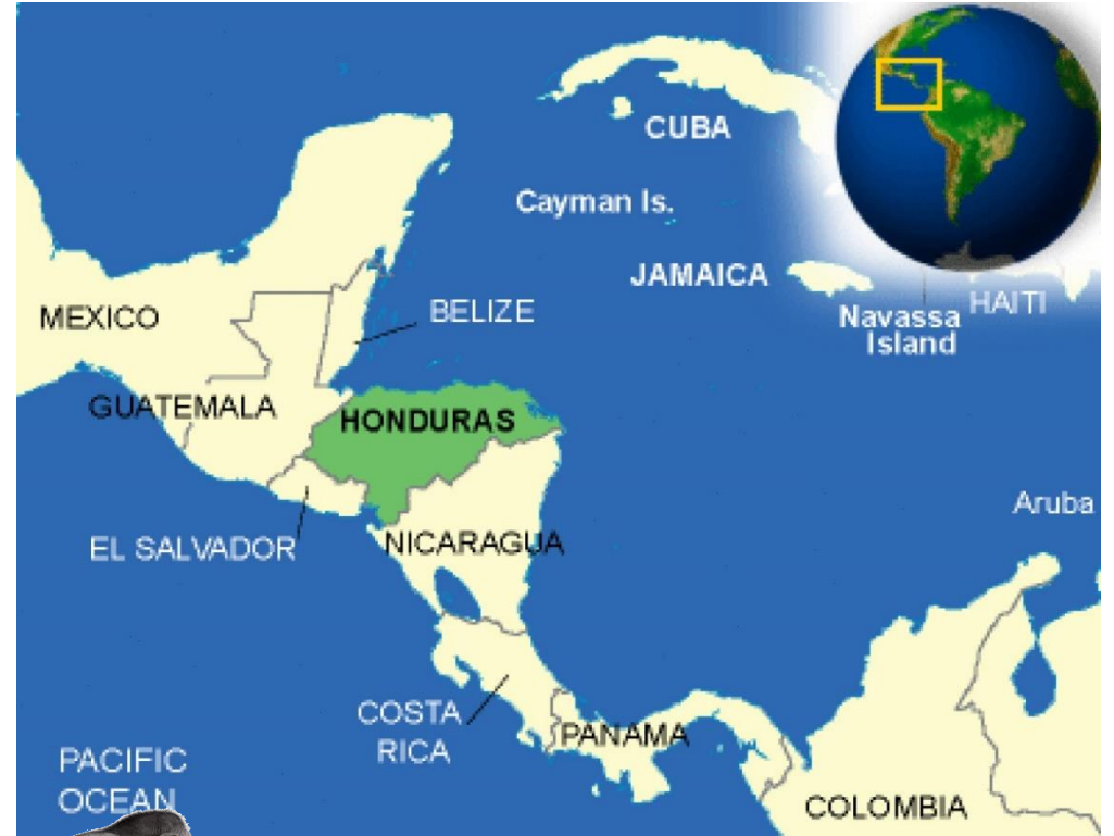
Acuacultrua Araujo Shrimp Operations – Choloteca, Honduras